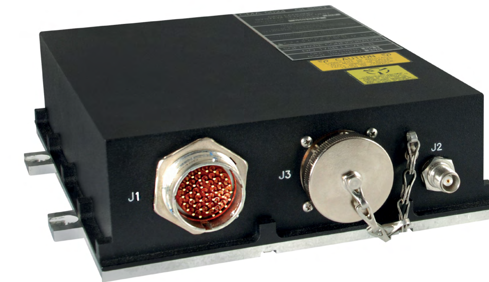
CMC Electronics CMA-5024 SBAS Receiver

At Fokker Services Group, our LPV capability fully complies with EASA AMC 20-28. The instrument approach procedure is a modern breakthrough in the aviation industry, offering incredibly precise GNSS capabilities to obtain the position of the aircraft.